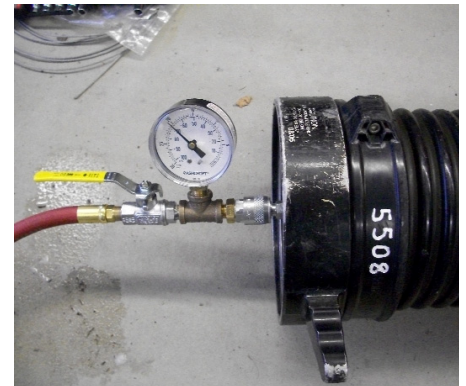
NUMBERING THE HOSE